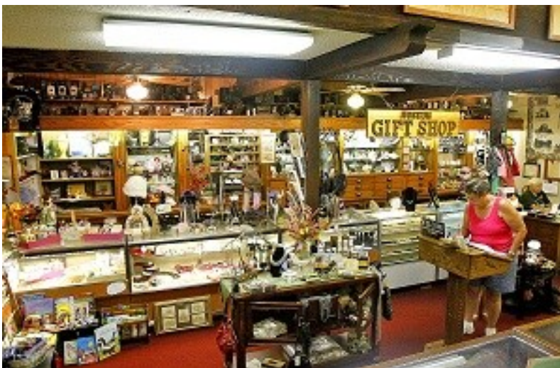
Help run the Museum's Gift Shop

Come join us! We welcome all newcomers to learn about Manteca, too!