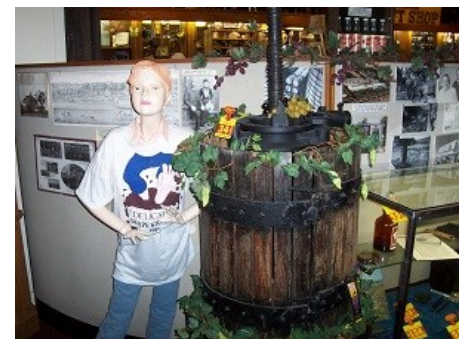
Delicato Winery exhibit

Requirements: You must be 18 or over, be friendly to people, be able to volunteer for at least one 2-3 hour shift monthly (12 month commitments are preferred), and you must be a yearly member of the Manteca Historical Society at any level! We appreciate all members, so member levels are discretionary, but it shows you care! Our current member/donor-levels recognized are: Students $5, Singles $15, Couples $25, Family $50, Sustaining Members $100, Organizations $100, Business Friend $250, Major Sponsor $500, Benefactors $1000 and Life Member $5000. All new and renewing memberships are published in our monthly newsletter both mailed and posted on our website.