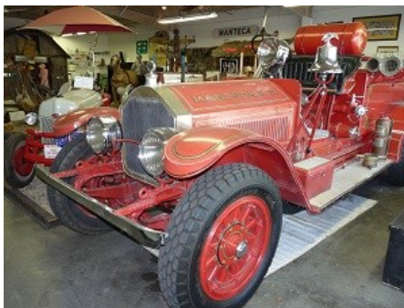
Manteca's 1st new firetruck, a 1927 LaFrance at the museum.

volunteering for other committees if you have more time to spare! No prior experience is necessary. You learn as you go as we pair you up with other museum docents.